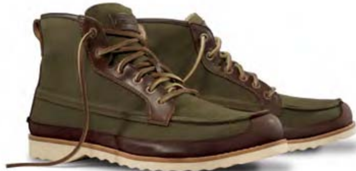
81507 | BROWN