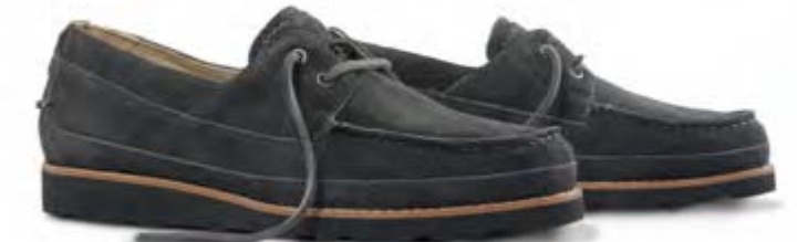
80579 | GREY