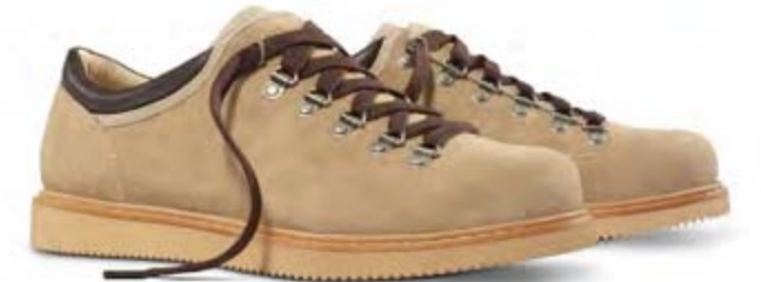
80588 | TAN