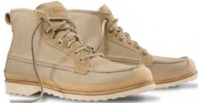
81506 | TAN

ANTI-FATIGUE TECHNOLOGY FOR ALL-DAY COMFORT