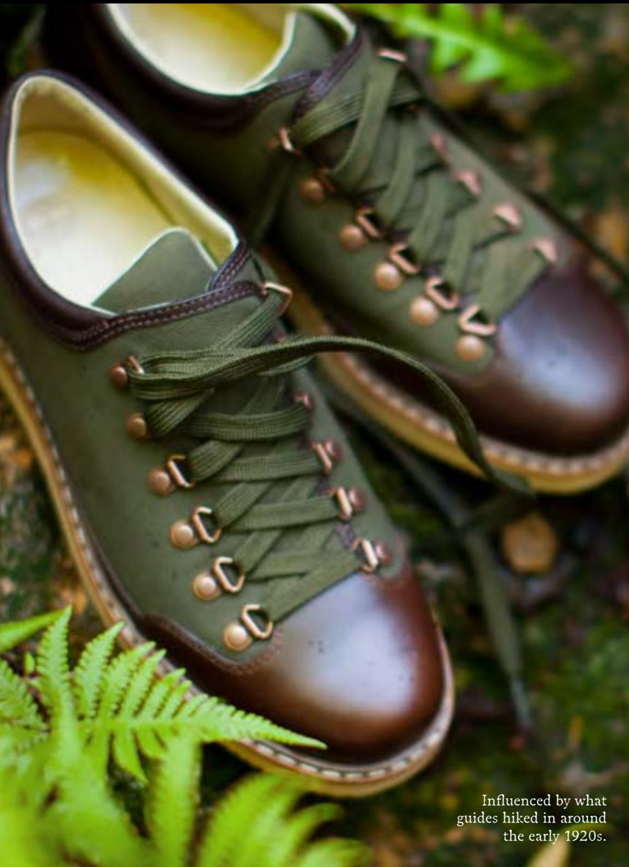
Influenced by what guides hiked in around the early 1920s.