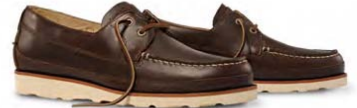
80578 | BROWN