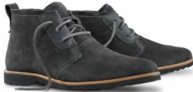
82589 | GREY