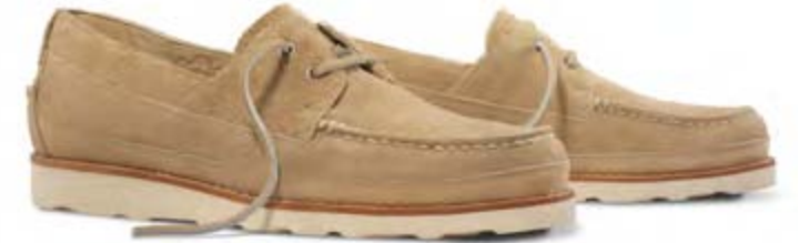
80577 | TAN

ANTI-FATIGUE TECHNOLOGY FOR ALL-DAY COMFORT