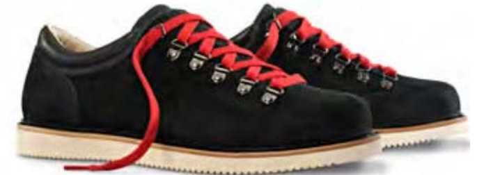
80587 | BLACK

ANTI-FATIGUE TECHNOLOGY FOR ALL-DAY COMFORT