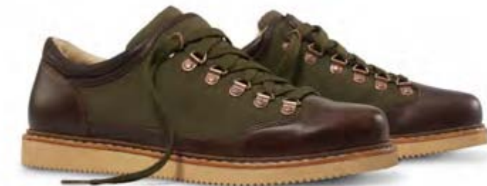
81505 | BROWN FABRIC LEATHER