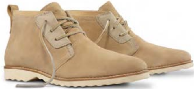
82588 | TAN

ANTI-FATIGUE TECHNOLOGY FOR ALL-DAY COMFORT