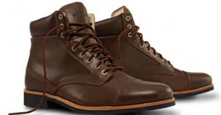
82591 | BROWN