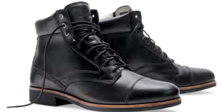
82546 | BLACK

ANTI-FATIGUE TECHNOLOGY FOR ALL-DAY COMFORT